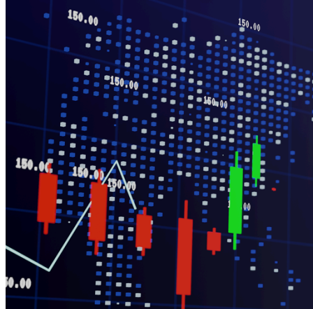
Construction of Index Portfolios