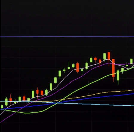
Corporate Action Impact