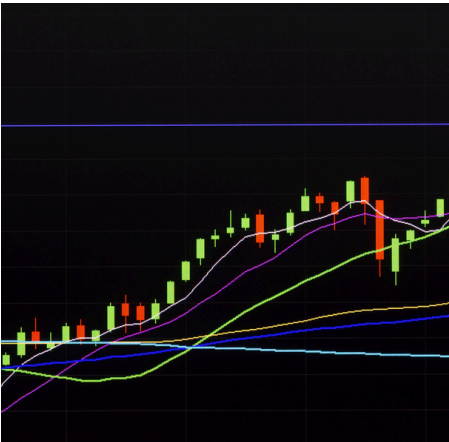
Financial Goal Setting